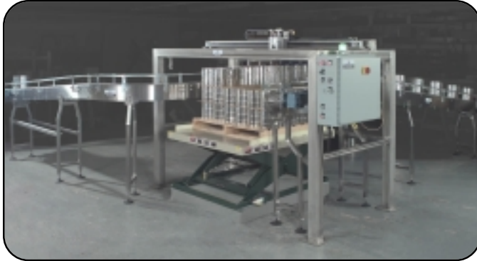
Pallet Loading / Unloading Station