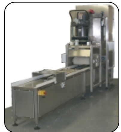
Magazine loaded Tray Indexing Conveyor with Tray Cleaning Module