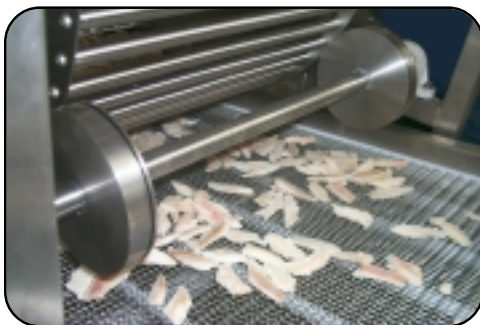
IQF Portion Spreader