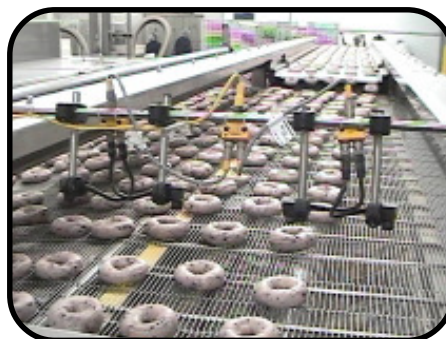
Tight nose discharge with Sensor for reciprocating control, Protective guard and Lexan Cover