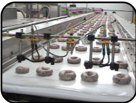
Oven Loading 12' Retracting Bed