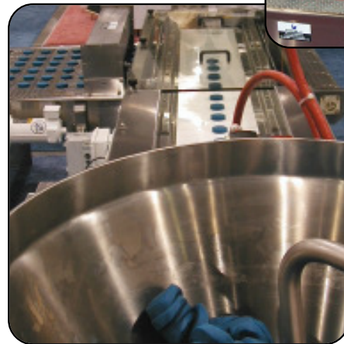
Reciprocator taking product from Vemag and placing it on Oven Conveyor