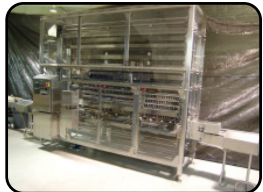
Offline Vertical Accumulator FIFO or FILO