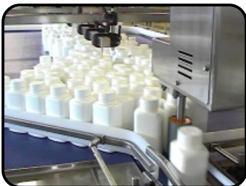
Bottle Orienter for Ovals and Rectangles