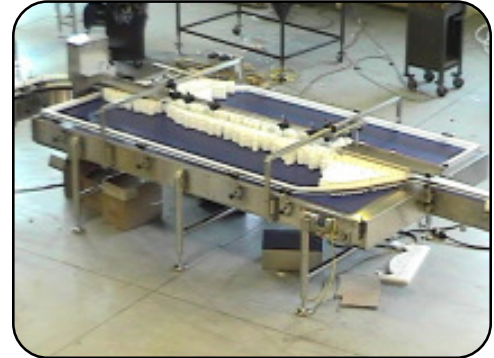
Inline Multi-directional Accumulation